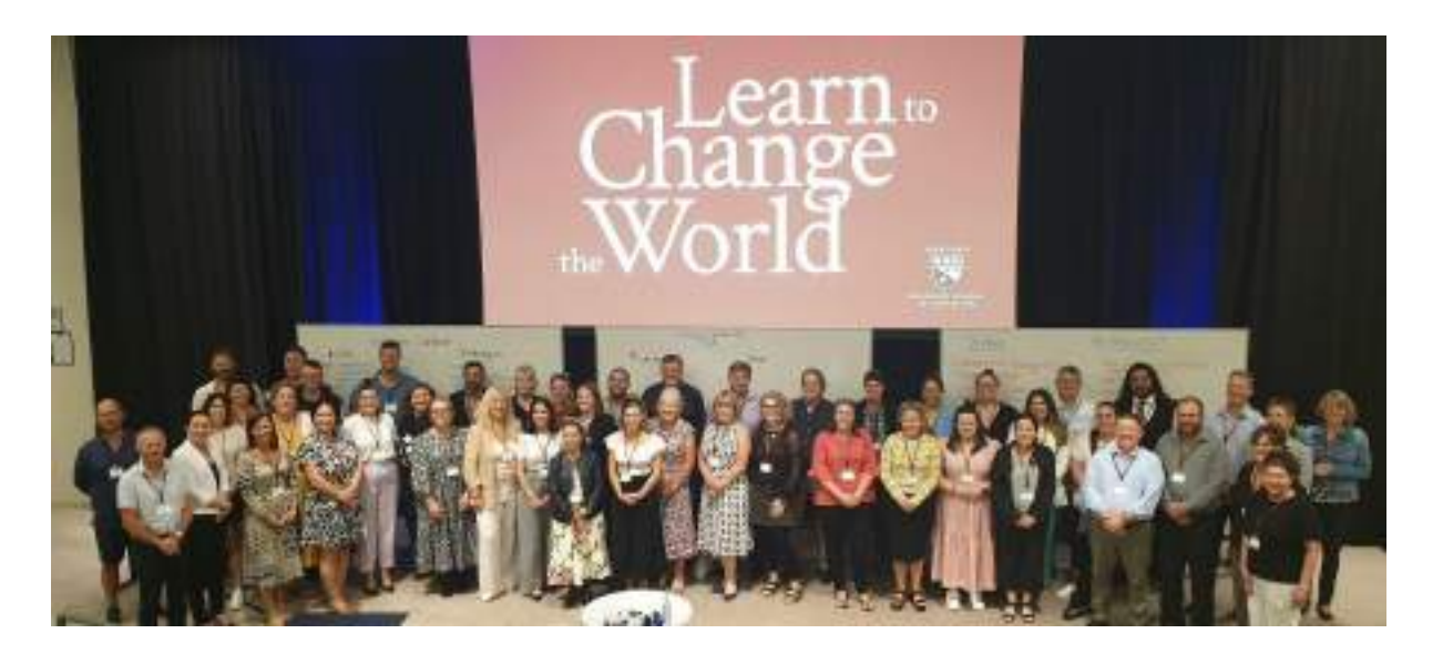
Scholarship winners at Principals Centre in Australia January 2024

In 2024 the Harvard Club of Australia (HCA) awarded 40 (47 in 2023) Scholarships to Public School Principals in less advantaged communities (ICSEA below 1000). The value of each scholarship being about $6,500, a total investment of $260,000. A scholarship covers 80% of the course fee (applicants have 20% skin in the game), 5 nights accommodation and a travel allowance of up to $500 depending on distance travelled. The funding for these scholarships was sourced from 12 donors the largest of which were The Eureka Benevolent Foundation and the Vernon Foundation. There was a small amount of "carry over" donations from the 2023 program. Of note, every applicant for a scholarship received funding.