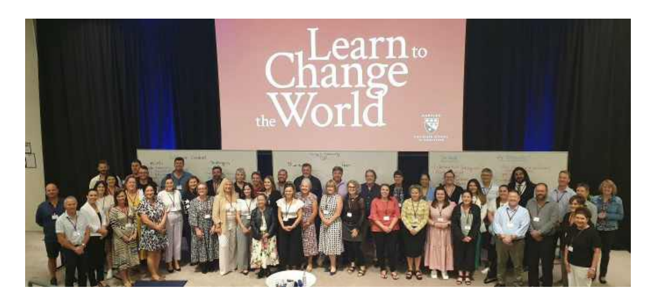
Scholarship winners at Principals Centre in Australia January 2024

In 2024 the Harvard Club of Australia (HCA) awarded 40 (47 in 2023) Scholarships to Public School Principals in less advantaged communities (ICSEA below 1000). The value of each scholarship being about $6,500, a total investment of $260,000. A scholarship covers 80% of the course fee (applicants have 20% skin in the game), 5 nights accommodation and a travel allowance of up to $500 depending on distance travelled. The funding for these scholarships was sourced from 12 donors the largest of which were The Eureka Benevolent Foundation and the Vernon Foundation. There was a small amount of "carry over" donations from the 2023 program. Of note, every applicant for a scholarship received funding.