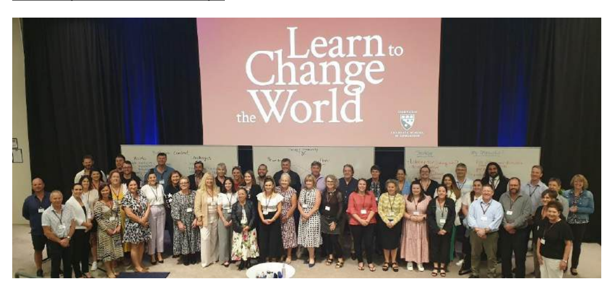
Scholarship winners at Principals Centre in Australia January 2023